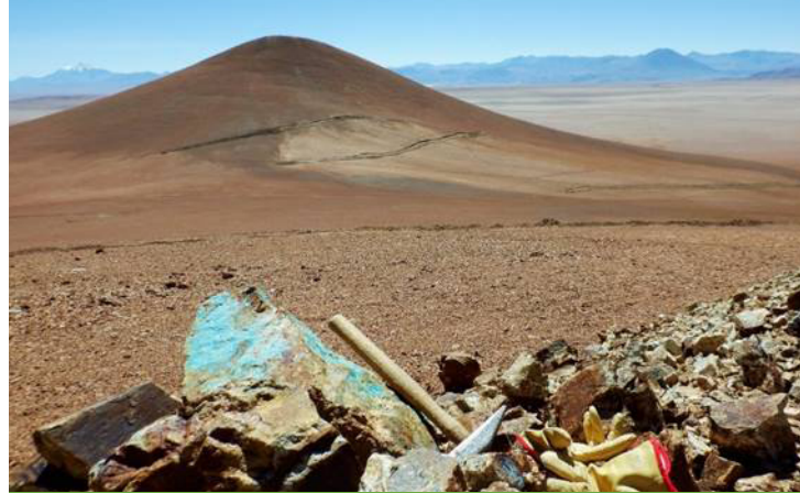
View of Buenavista Target Porphyry & Quartz-Veinlet Stockwork Zone, with Cu-Oxides in Pampa Metals' Trenches in Foreground