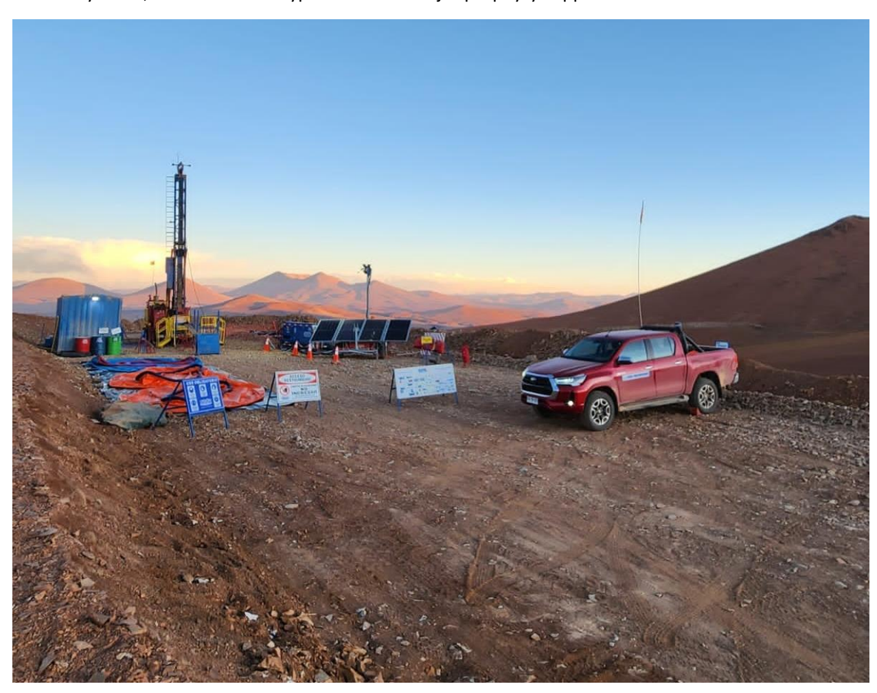
Buenavista Target - Block 4 - Drill Rig on Site for First Drill Hole