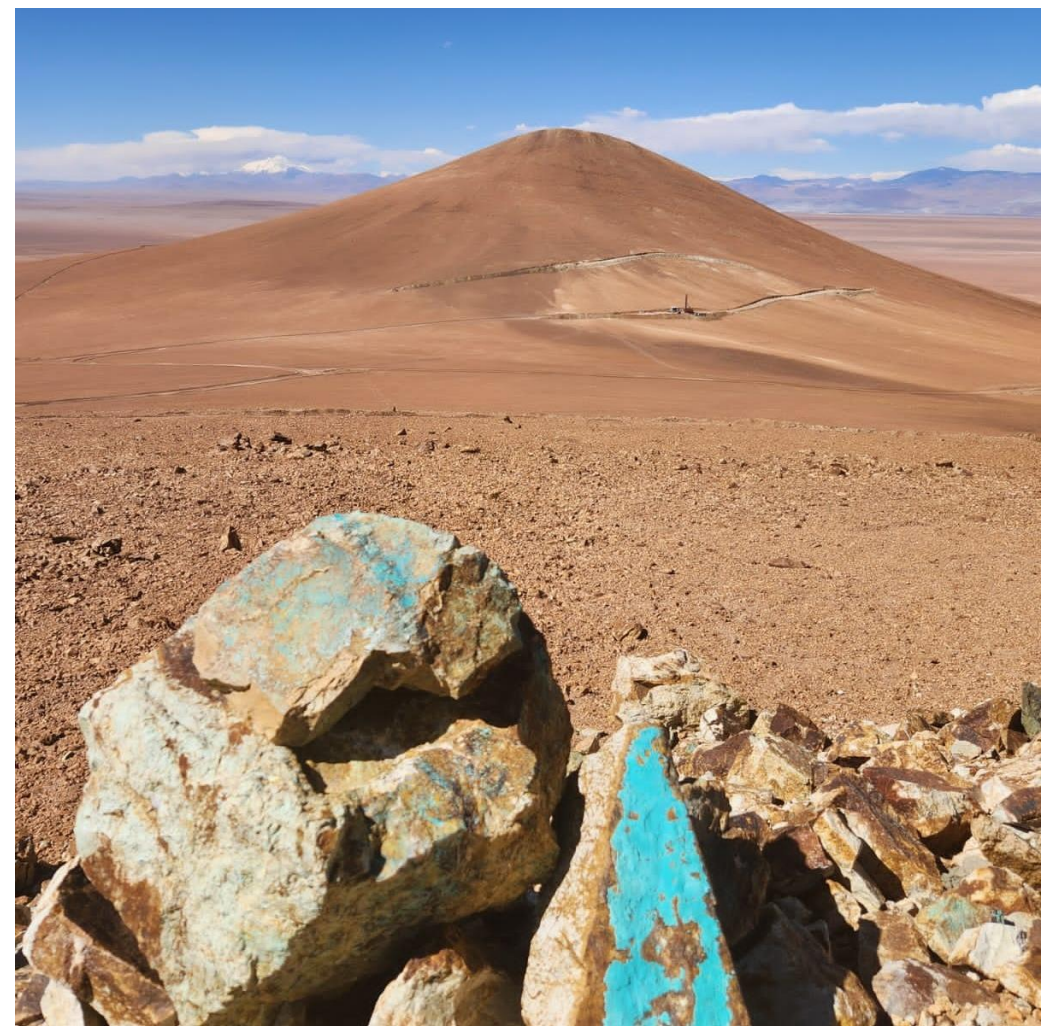
Buenavista Target - Block 4 - Drill Rig on Site (light coloured area) for First Drill Hole

The first drill hole is centred on the dacite porphyry and phreatomagmatic breccia complex with quartz-veinlet stockworking at Buenavista, and is initially targeted to a depth of about 750m. The drill hole diameter will be HQ, with the option of reducing to NQ at depth, depending on drilling conditions.